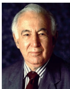
Rt Hon. Sir Zelman Cowen AK, GCMG, GCVO, QC

It was with enormous sadness that the Australian-American Fulbright Commission noted the passing of one of its most prominent Alumni, Sir Zelman Cowen.